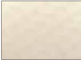
Versico VersiWeld TPO with OctaGuard XT Samples subjected to 275°F heat aging.