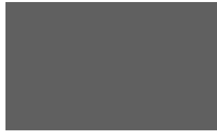
Dark Gray †