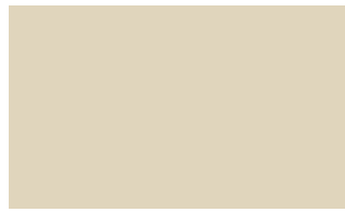
**Light Tan (SRI = 90)