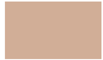
*Tan (SRI = 82)