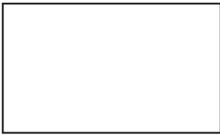
**Bright White (SRI = 100-110)